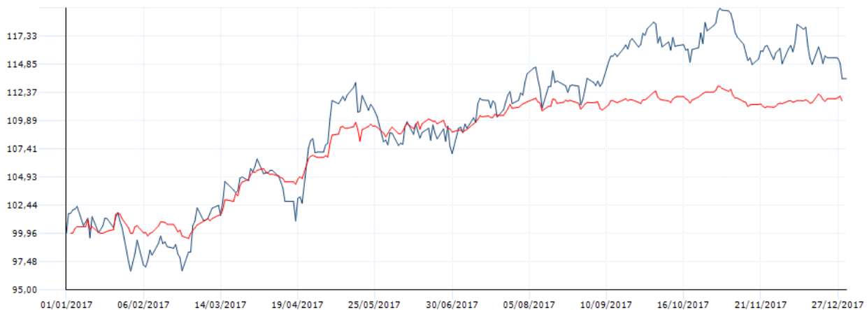
Rischio / Rendimento