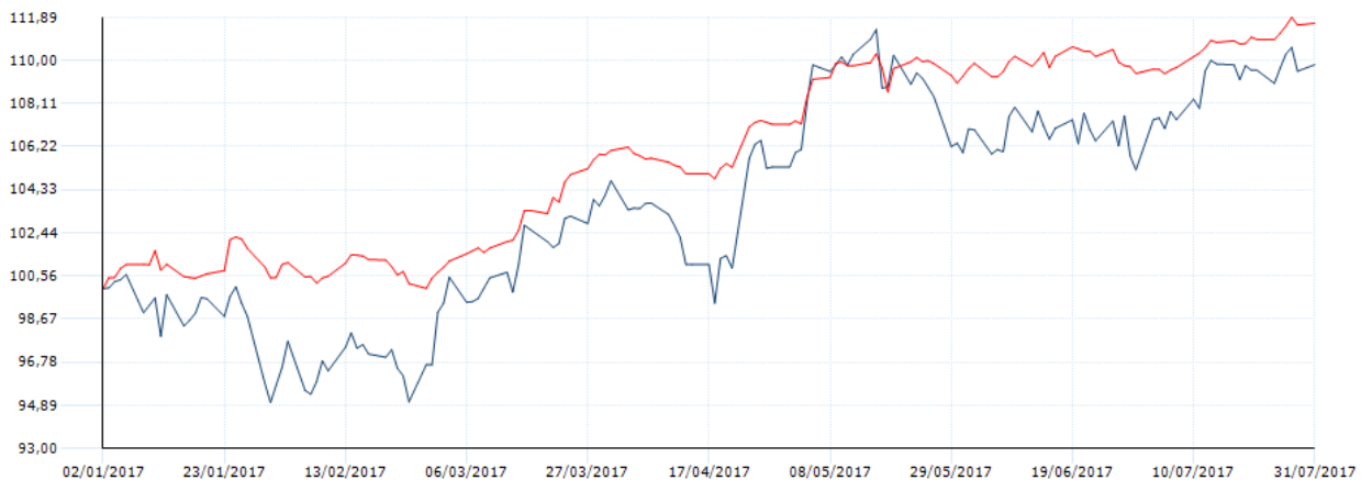
Rischio / Rendimento