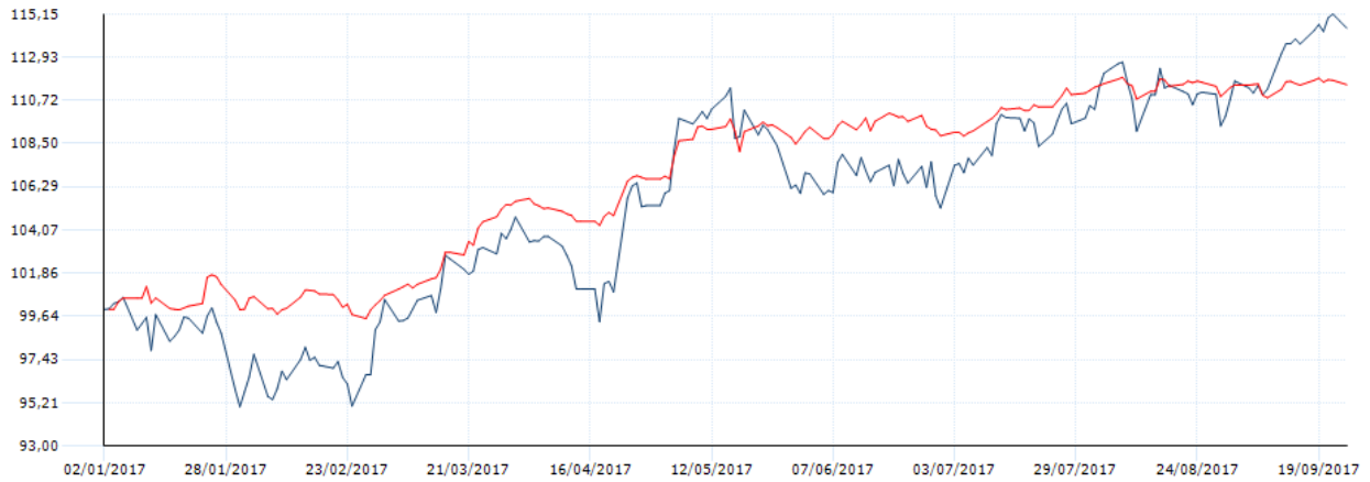
Rischio / Rendimento