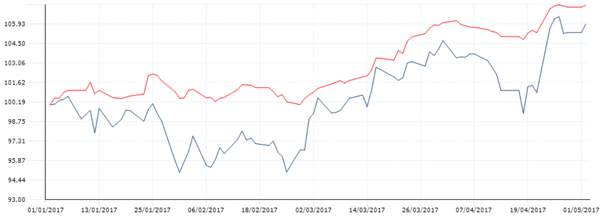
Periodo di analisi dal 02/01/2017 al 02/05/2017